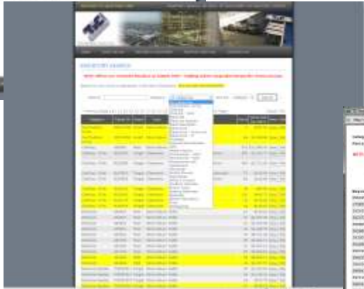
Inventory Listing & Search Page