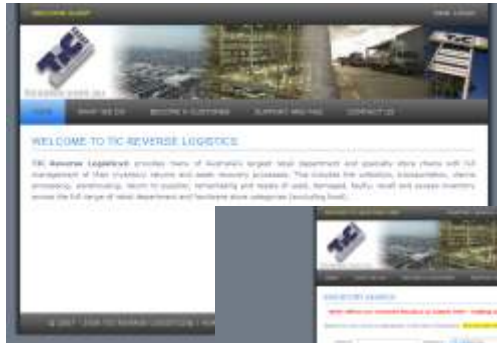
Home Page & User Login