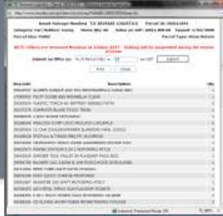
Parcel Detail & Offer Page